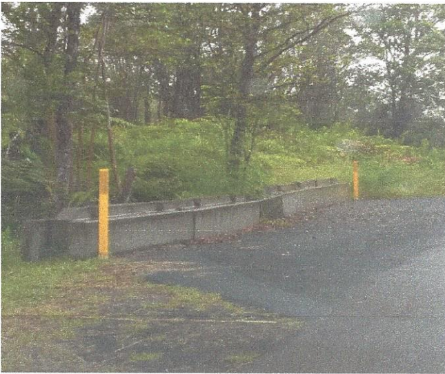
'Ohia'a Nani Road (Volcano side)

Article courtesy of Penny Blakeman